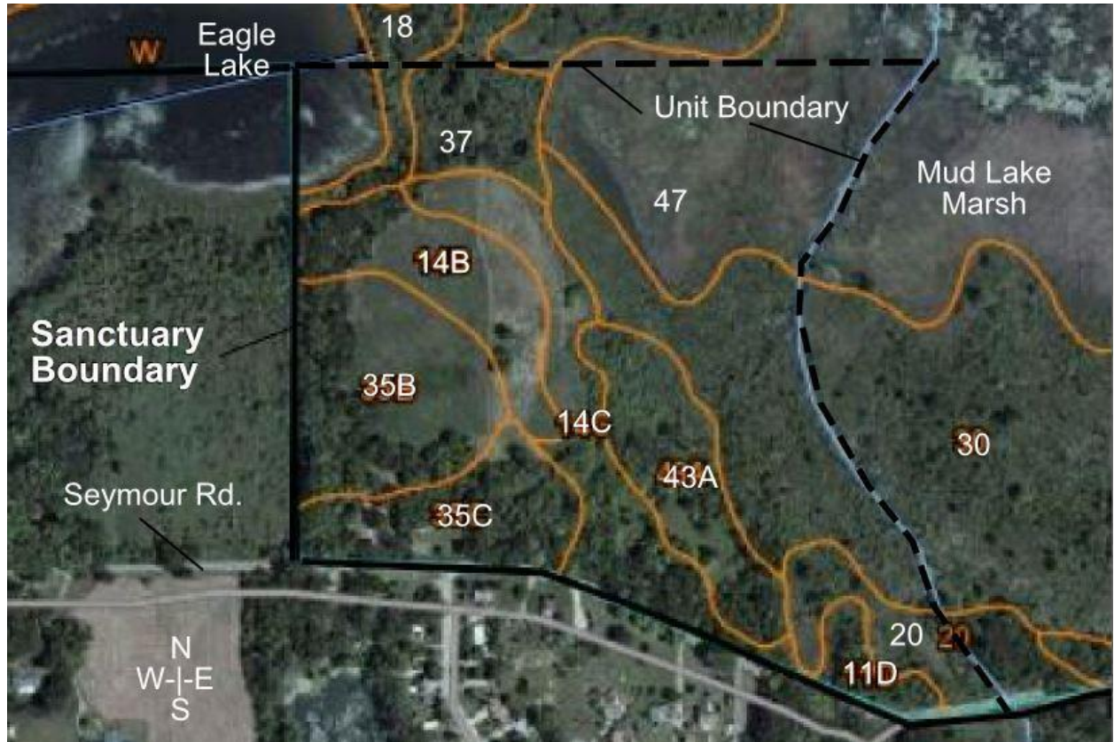
Figure 1. Unit 1 Soil Map